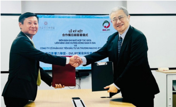
The Signing Ceremony of Cooperation with the Southeast Asia Impact Alliance