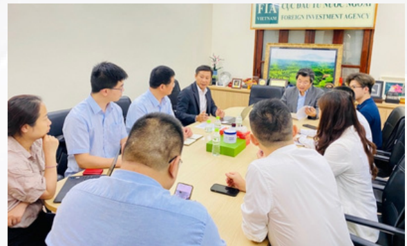
Meeting with Sunrise Group at the Foreign Investment Agency (FIA)