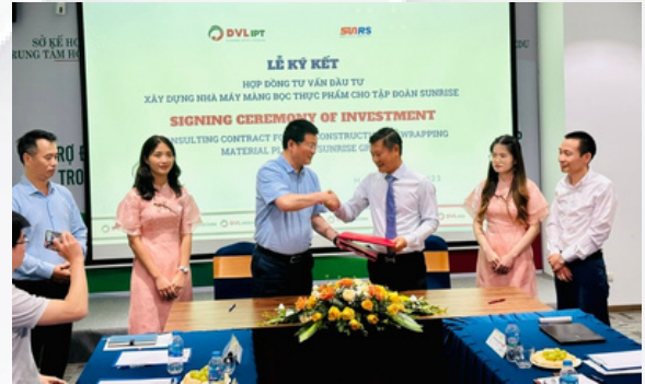
Signing Ceremony of the Contract with Sunrise Group