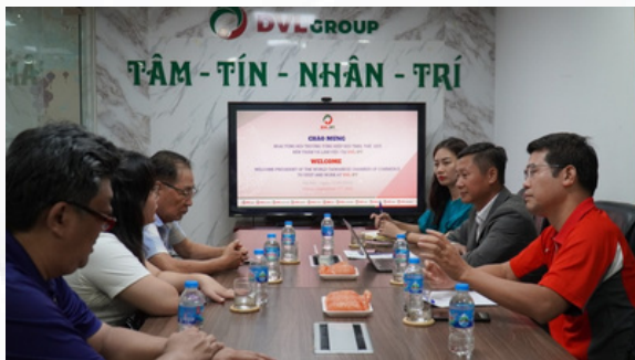
Meeting and Working with the General President of the World Assemblies of God