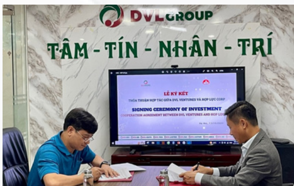
Signing Ceremony of Cooperation with Hop Luc Group