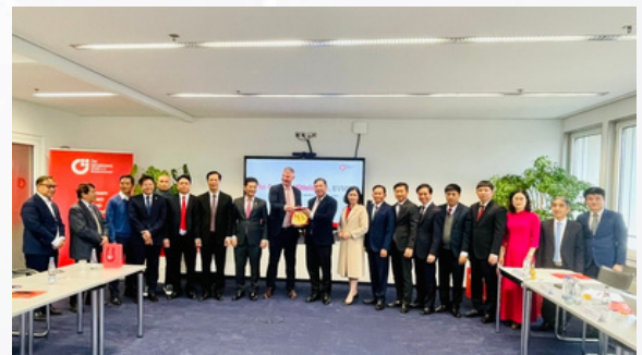
Promoting and Expanding Investment Opportunities with the Nam Dinh Province Delegation in Europe