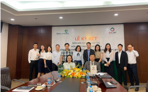
Signing Ceremony of Cooperation with Vietcombank