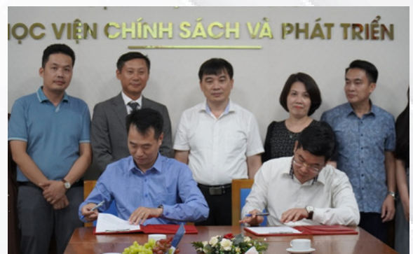
Signing Ceremony of Cooperation with the Academy of Policy and Development (APD)